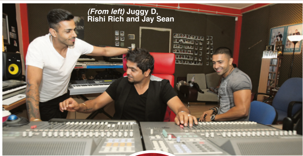
(From left) Juggy D, Rishi Rich and Jay Sean

17 Reunion: Rishi Rich, Juggy D and Jay Sean surprised the entire music industry by reuniting in the studio a decade after they first got together. They have picked up from where they left off and will be dropping their musical bombs in 2014. The inside word is that the songs are going to be pretty special.