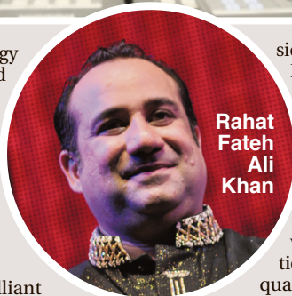
Rahat Fateh Ali Khan

14 Alchemy: The amazing Alchemy music festival at the Southbank Centre in London hosted a series of spectacular live events powered by world-class performers. The highlight of the musical calendar showed us all just why it is the leading mu-