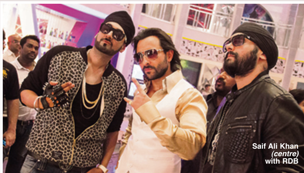
Saif Ali Khan (centre) with RDB