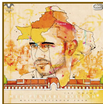
Bat For Lashes

4 Best Live Act: Bat For Lashes was nominated at prestigious ceremonies like the Brit Awards and even gave us some superb new music, but she made her ultimate mark on the live scene. Real name Natasha Khan, the British-Asian singer/songwriter performed at huge music festivals and prestigious venues around the world. She showed just why she is one of the finest performers in the world.